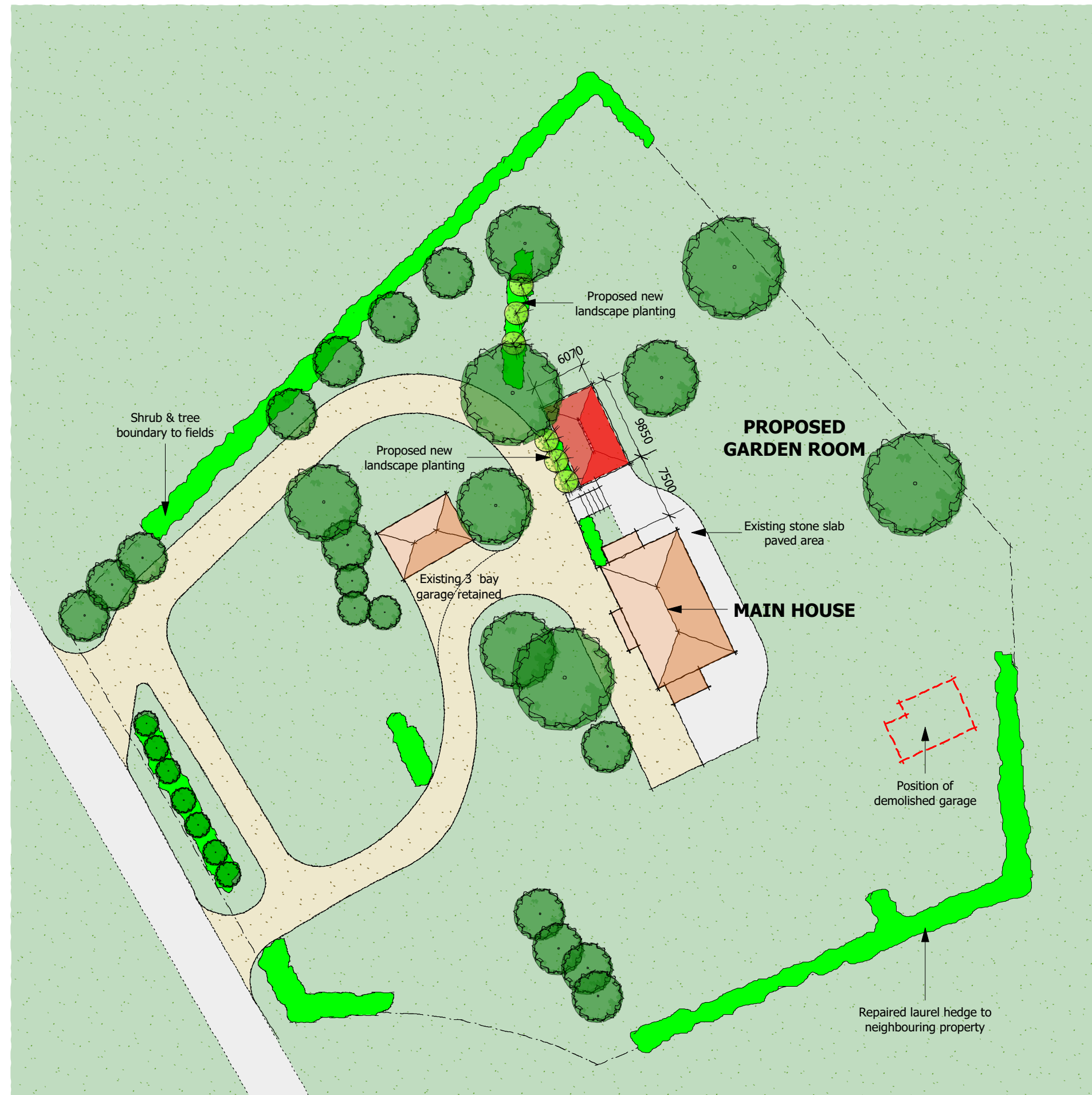
PROPOSED BLOCK PLAN - Scale 1:500